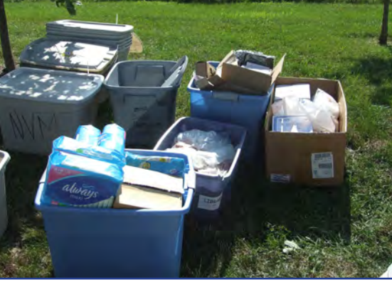
Just some of the donations received at the KLOVE 101.9 NVM Donation Day in Carmel.

We ask that our readers prayerfully consider sponsoring the children at Nehemiah Christian Academy so that they may get the education necessary to help rebuild Haiti.