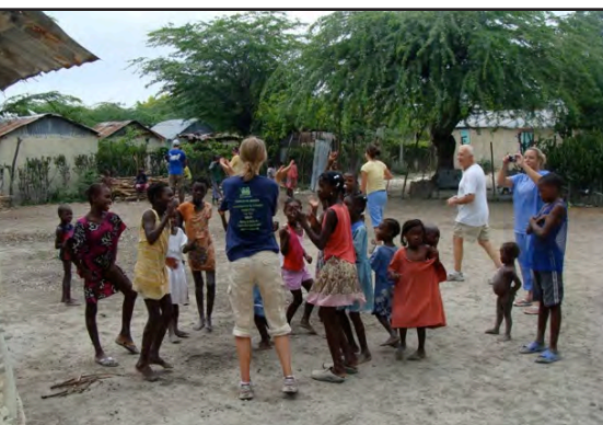
Teaching the kids how to do the Hokey Pokey!