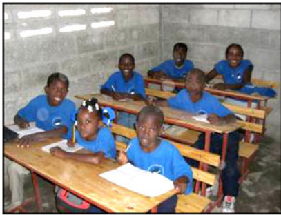
Second grade class and their new benches